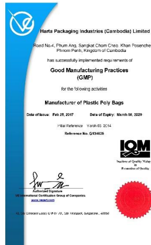
Quality Management System Good Manufacturing Practice (GMP) Plastic Poly Bags