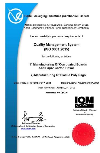
Quality Management System ISO 9001:2015 Corrugated Boards, Paper Carton Boxes & Plastic Poly Bags