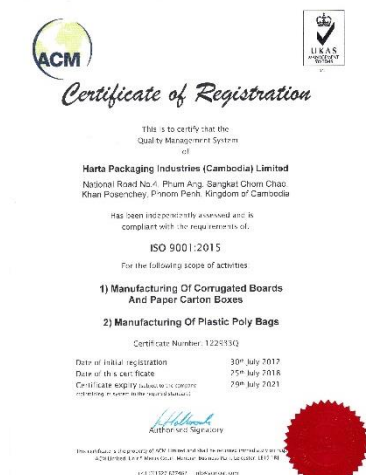
Quality Management System ISO 9001:2015 (ACM)