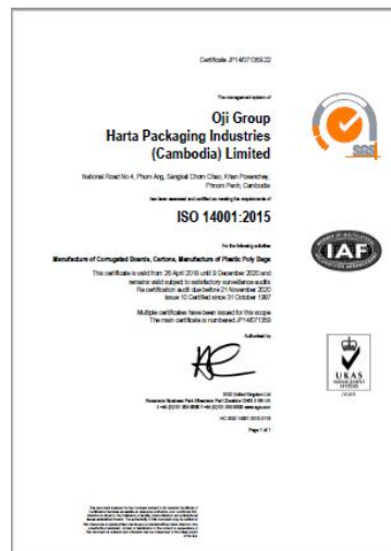
Environment Management System (SGS) ISO 14001:2015