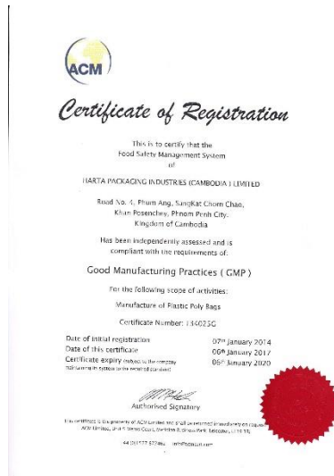
Quality Management System Good Manufacturing Practice (ACM) Plastic Poly Bags

Harta Packaging Industries (Cambodia) Limited adopts an Integrated Management System that not only focuses on quality excellence, but also embraces the environmental and safety concepts close to our hearts as evidenced by our achievement of the prestigious ISO 9001:2015 and ISO 14001:2015 Certifications . We have also been awarded the Good Manufacturing Practice (GMP) Certifications for plastic poly-bags.