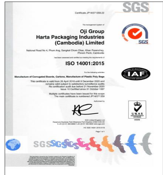
Environmental Management System ISO 14001:2015 Corrugated Boards, Paper Carton Boxes & Plastic Poly Bags