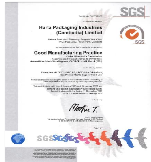
Good Manufacturing Practice (GMP) Plastic Poly Bags