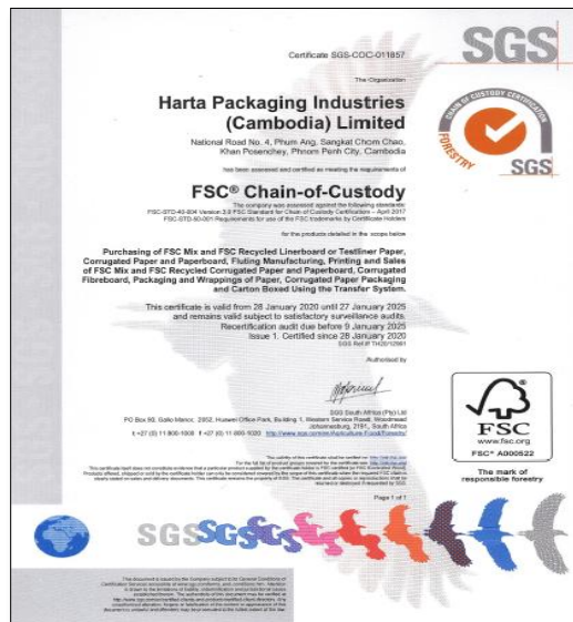
Forest Stewardship Council (FSC) Paper Carton Boxes