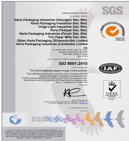
Quality Management System ISO 9001:2015 Corrugated Boards, Paper Carton Boxes & Plastic Poly Bags

Harta Packaging Industries (Cambodia) Limited adopts an Integrated Management System that not only focuses on quality excellence, but also embraces the environmental and safety concepts close to our hearts as evidenced by our achievement of the prestigious ISO 9001:2015 and ISO 14001:2015 Certifications . We have also been awarded the Good Manufacturing Practice (GMP) Certifications for plastic poly-bags and Forest Stewardship Council (FSC) for paper carton boxes.