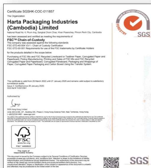
Forest Stewardship Council (FSC) Paper Carton Boxes