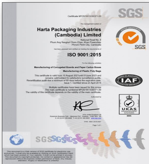
Quality Management System ISO 9001:2015 Manufacturing of Corrugated Boards and Paper Carton Boxes

Harta Packaging Industries (Cambodia) Limited adopts an Integrated Management System that not only focuses on quality excellence, but also embraces the environmental and safety concepts close to our hearts as evidenced by our achievement of the prestigious ISO 9001:2015 and ISO 14001:2015 Certifications . We have also been awarded the Good Manufacturing Practice (GMP) Certifications for plastic poly-bags and Forest Stewardship Council™ (FSC™) , License Code: FSC-C154914 for paper carton boxes.