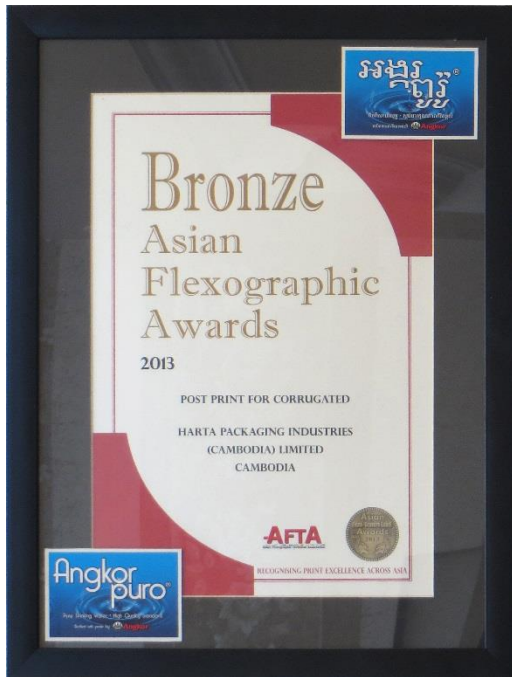
BRONZE Asian Flexographic Awards 2013