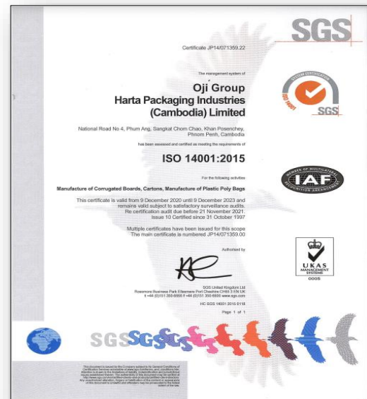
Environmental Management System ISO 14001:2015 Manufacturing of Corrugated Boards and Paper Carton Boxes