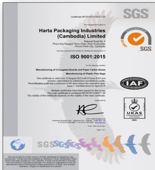
Quality Management System ISO 9001:2015 Manufacturing of Corrugated Boards and Paper Carton Boxes

Harta Packaging Industries (Cambodia) Limited adopts an Integrated Management System that not only focuses on quality excellence, but also embraces the environmental and safety concepts close to our hearts as evidenced by our achievement of the prestigious ISO 9001:2015 and ISO 14001:2015 Certifications . We have also been awarded the Good Manufacturing Practice (GMP) Certifications for plastic poly-bags and Forest Stewardship Council™ (FSC™) , License Code: FSC-C154914 for paper carton boxes.