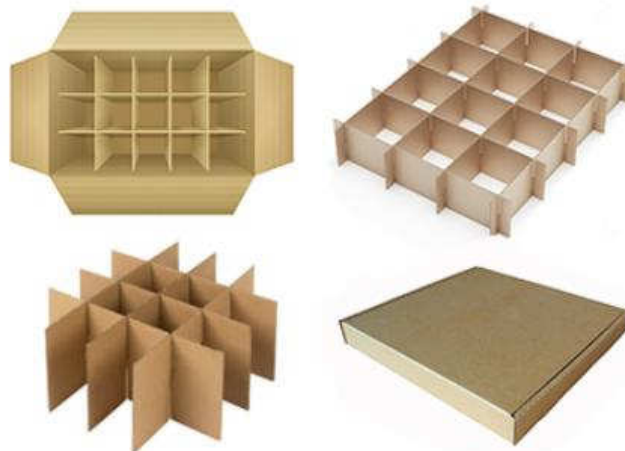
Nestings / Fittings / Dividers / Layer Pads