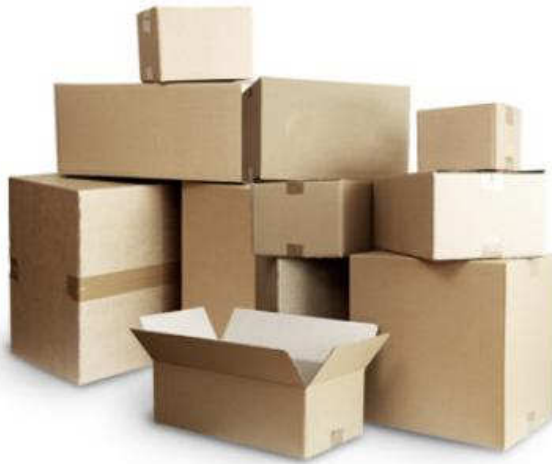
Corrugated Carton Boxes

Our corrugated board is an extremely flexible packaging material that can allow us to provide innovative carton boxes and accommodate a wide range of printing options to fully support our customers' packaging, marketing and sales requirements. With such high technological designs and flexographic printing equipment at work, we ensure our customers' packaging expectations are realized with the highest quality of carton boxes we provide.