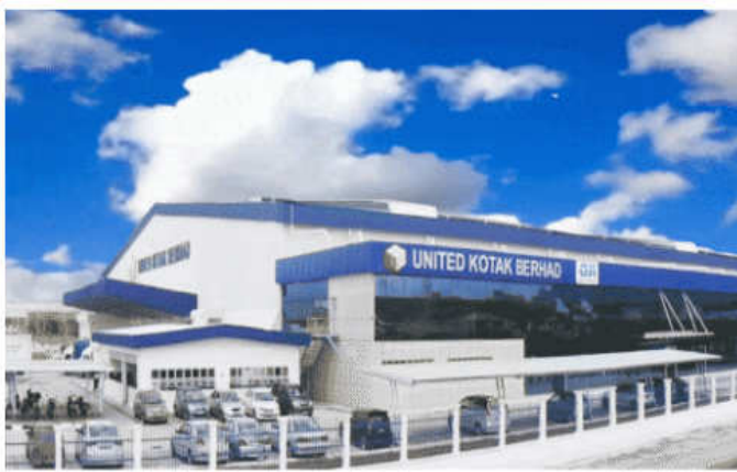
UKB – Plant 1