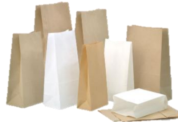
Square Bottom Paper Bag