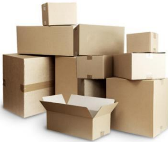
Corrugated Carton Boxes

Our corrugated board is an extremely flexible packaging material that can allow us to provide innovative carton boxes and accommodate a wide range of printing options to fully support our customers' packaging, marketing and sales requirements. With such high technological designs and flexographic printing equipment at work, we ensure our customers' packaging expectations are realized with the highest quality of carton boxes we provide.