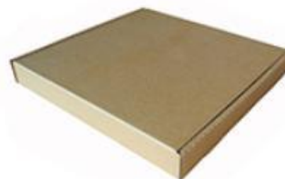
Nestings / Fittings / Dividers / Layer Pads